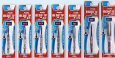
Hex Shaft Tap (M3~M12)