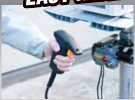
Electric Operation With Speed Controller