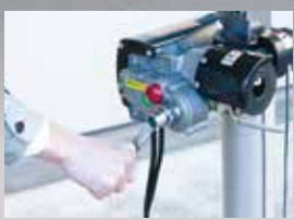
Manual Operation For Height adjustment